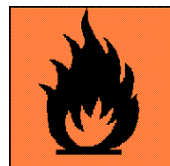
4. F+=Extremely flammable