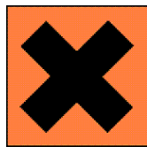
3. Xi = Irritant