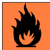
5. F= Flammable